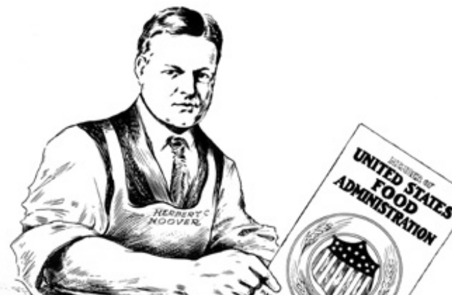
Herbert Hoover Caricature

While in Rome, meeting with Italian officials before heading home on December 6, 1915, Walcott "received a sudden awakening" in the form of a cable from John D. Rockefeller, asking him to represent The Rockefeller Foundation and report on the war refugee situation in German-held Belgium. The Rockefeller Foundation was prepared to donate generously to feed and clothe the Belgians but they wanted Walcott to observe the situation up close to determine just how much money and supplies they should send.