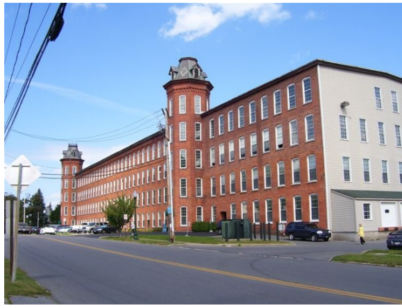
Walcott/Campbell Mill - New York Mills, NY